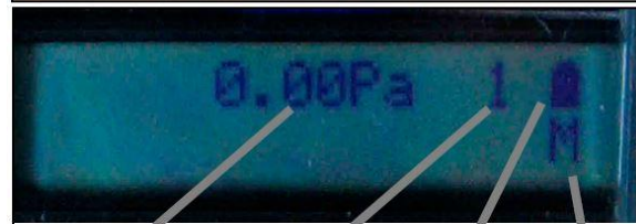
Measurement CH Battery F/M/S

to use an old, but trusted calibration. The manometer can be connected to a PC with the help of the USB port. That is an easy way to transfer data: measured values can be saved to text file.