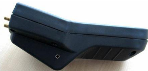
Battery charger slot

The digital handheld manometer works with 1 or 2 9V set-in batteries. The batteries can be full-charged with a battery charger which has to be connected to the Ø3.5mm jack adapter found on the left side. After charging, the manometer can work continuously for 15 hours per battery. The charge level can be found at the upper right corner of the display unit.