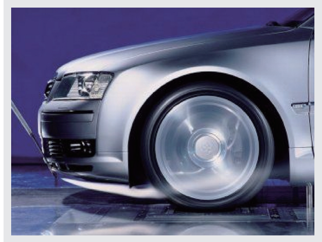
Figure 6 Wheel Rotation with Wheel Spinner