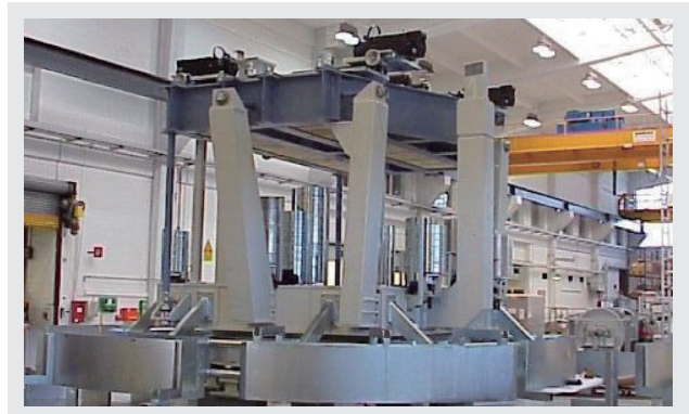
Figure 3 Balance Platform Held Statically Fixed

Figure 3 shows the balance platform under assembly. The platform is connected with flexible rods to a frame at an early stage of the balance erection. On top of the platform the servo motors of the wheel spinners, which are mounted on the platform, can be seen.