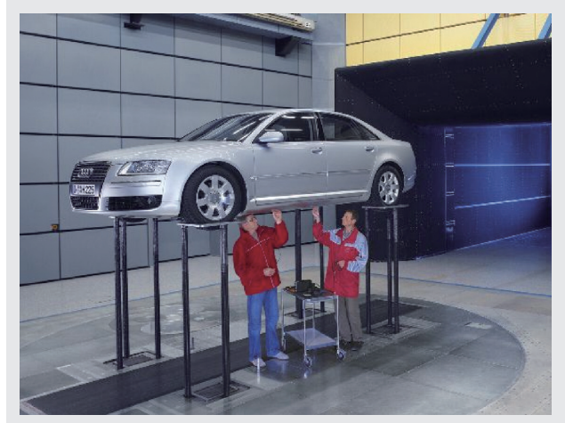
Figure 4 Lift System

To rotate the vehicle around the vertical z-axis, the wind tunnel balance and the test section floor can be rotated. A vehicle lift unit is integrated in the balance system to lift the vehicle up to 1800 mm allowing fast modification work in the wind tunnel on the underside of the vehicle. Figure 4 shows the turntable and the lift units of the wind tunnel. The lift units are integrated around the wheel spinner units.